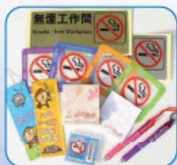
Health education materials

To facilitate managers of workplace to implement smoke-free measures, we have prepared a series of no smoking signage, posters, pamphlets, as well as this implementation guide and other free materials. Interested parties can download the Health Education Materials Application Form from Tobacco Control Office's website www.tco.gov.hk , and fill in the form and send to our office by fax or post.