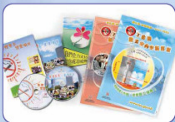
Smoke-free audio-visual materials and posters