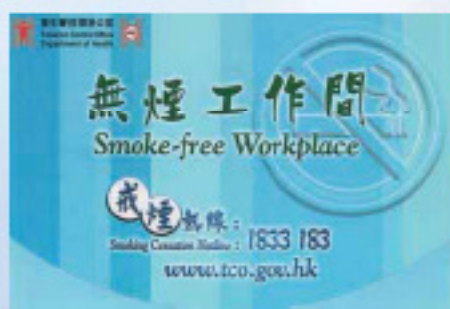
Smoke-free Workplace Folder